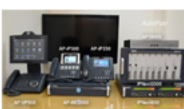
Secure IP Telephony Solution based on TLS,SRTP standard protocol