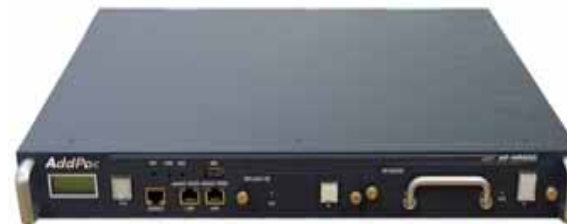
AP-NR500 Voice Recording Server