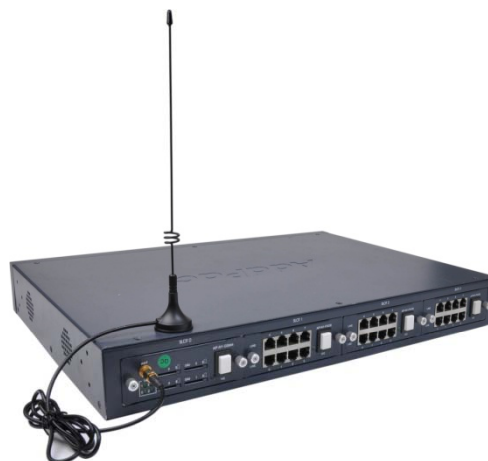
IPNext-MX250 obile Hybrid IP-PBX System