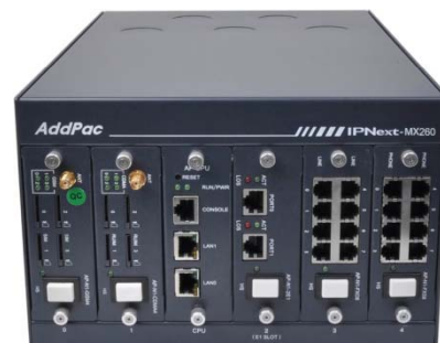
IPNext-MX260 Mobile Hybrid IP-PBX System