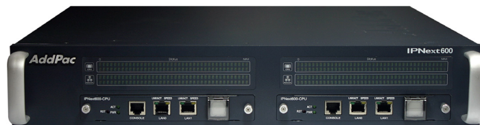
IPNext600 IP-PBX System