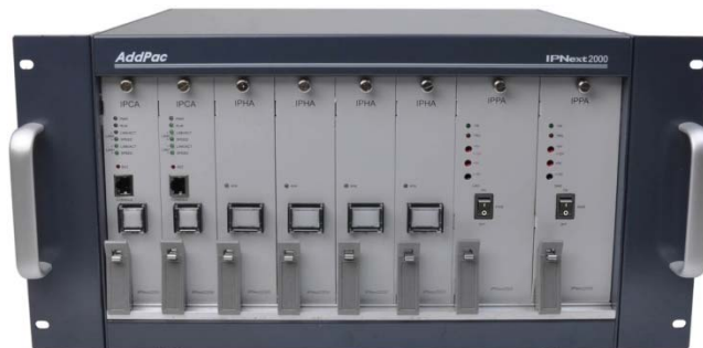
IPNext2000 IP-PBX System