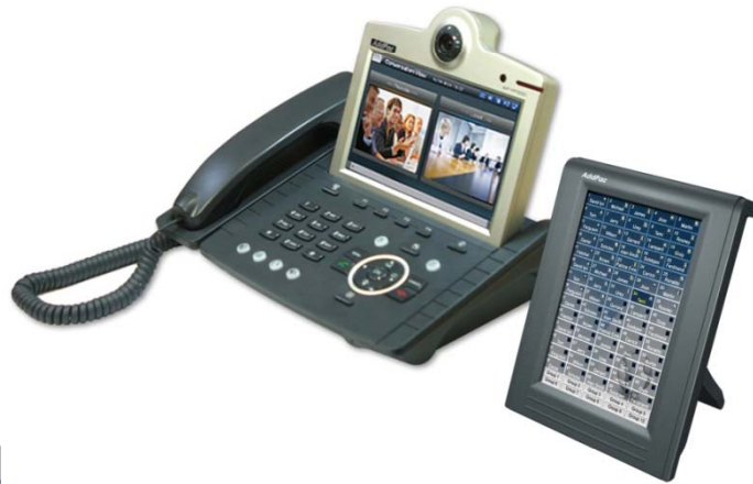
Presence Terminal (AP-PT100)