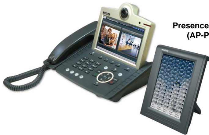
Presence Terminal (AP-PT100)

Smart Multimedia Manager for Call Manager