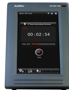
AP-VRT100 Voice Recording Terminal