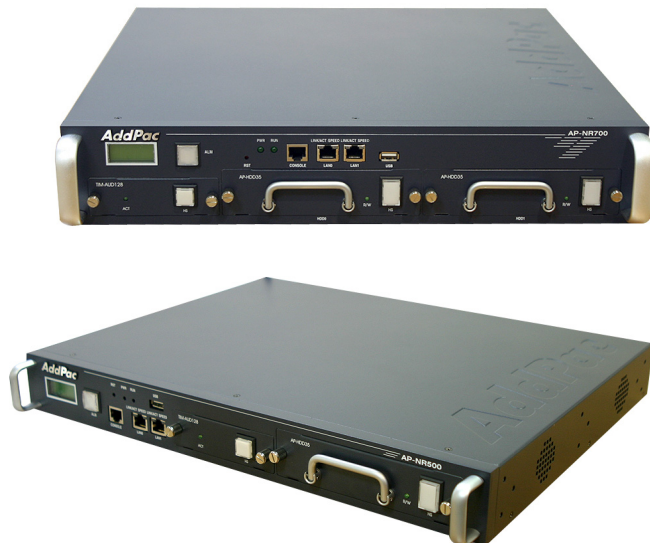
AP-NR700, AP-NR500 Voice Recording Server