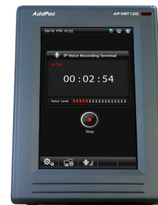
AP-VRT100 Voice Recording Terminal