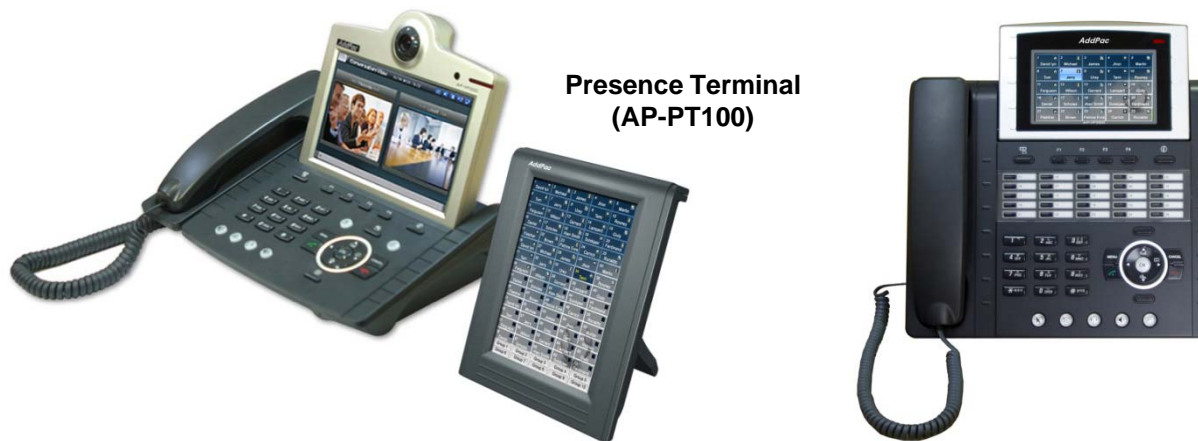
Presence Terminal (AP-PT100)