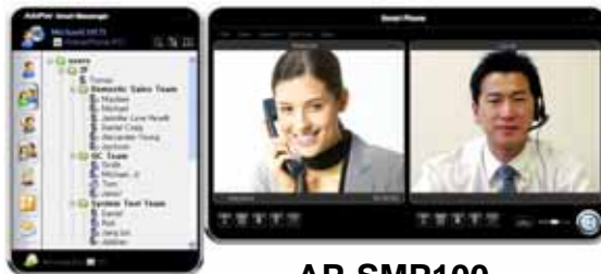
AP-SMP100 Smart Communicator