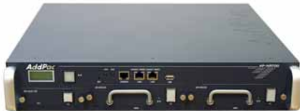
AP-NR700 Voice Recording Server