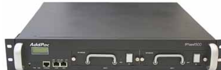
AP-RS2000 RTP Proxy Server With Voice Recording Interface