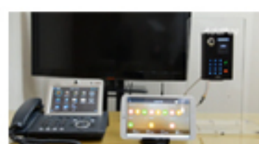
Smart Home Solution