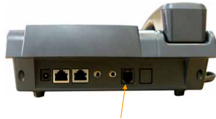
FXO Interface for PSTN